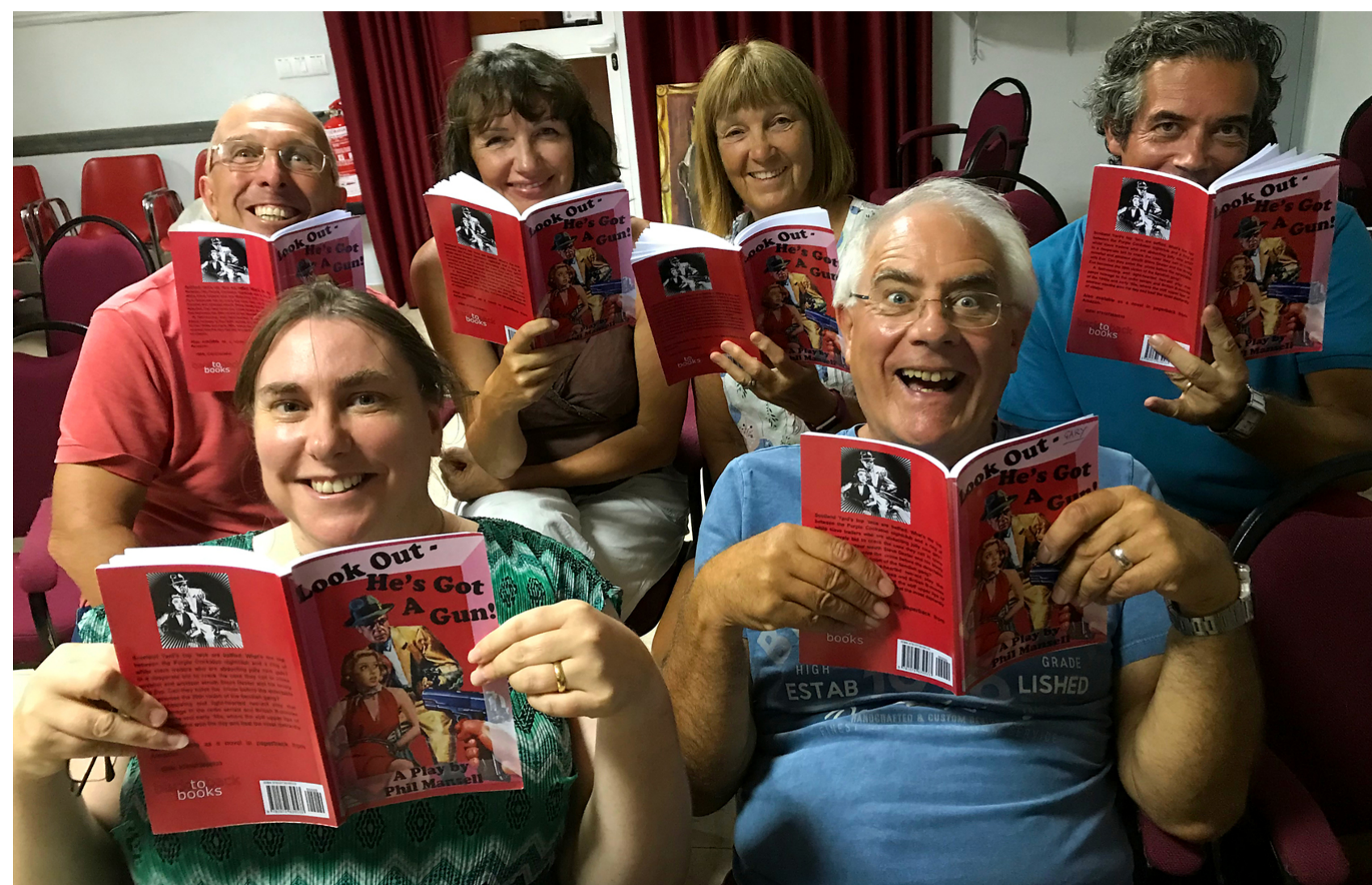
Members of the cast of ' Look Out - He's Got A Gun! ' are pictured busily learning their lines at rehearsal.