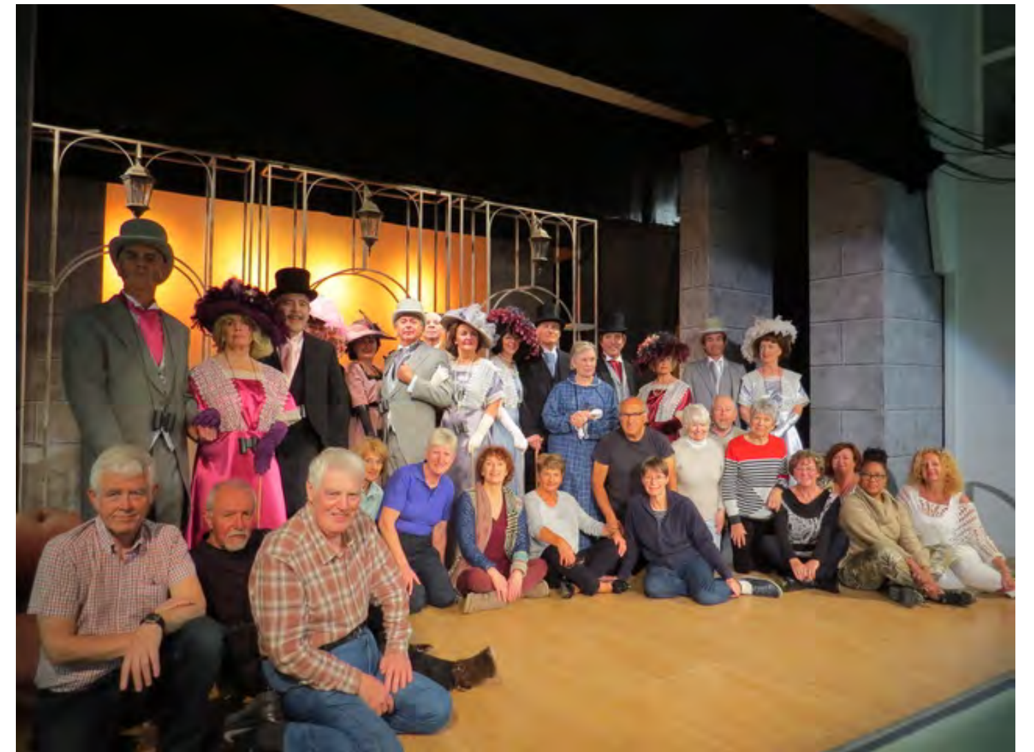
Just a reminder of the many that worked on My Fair Lady